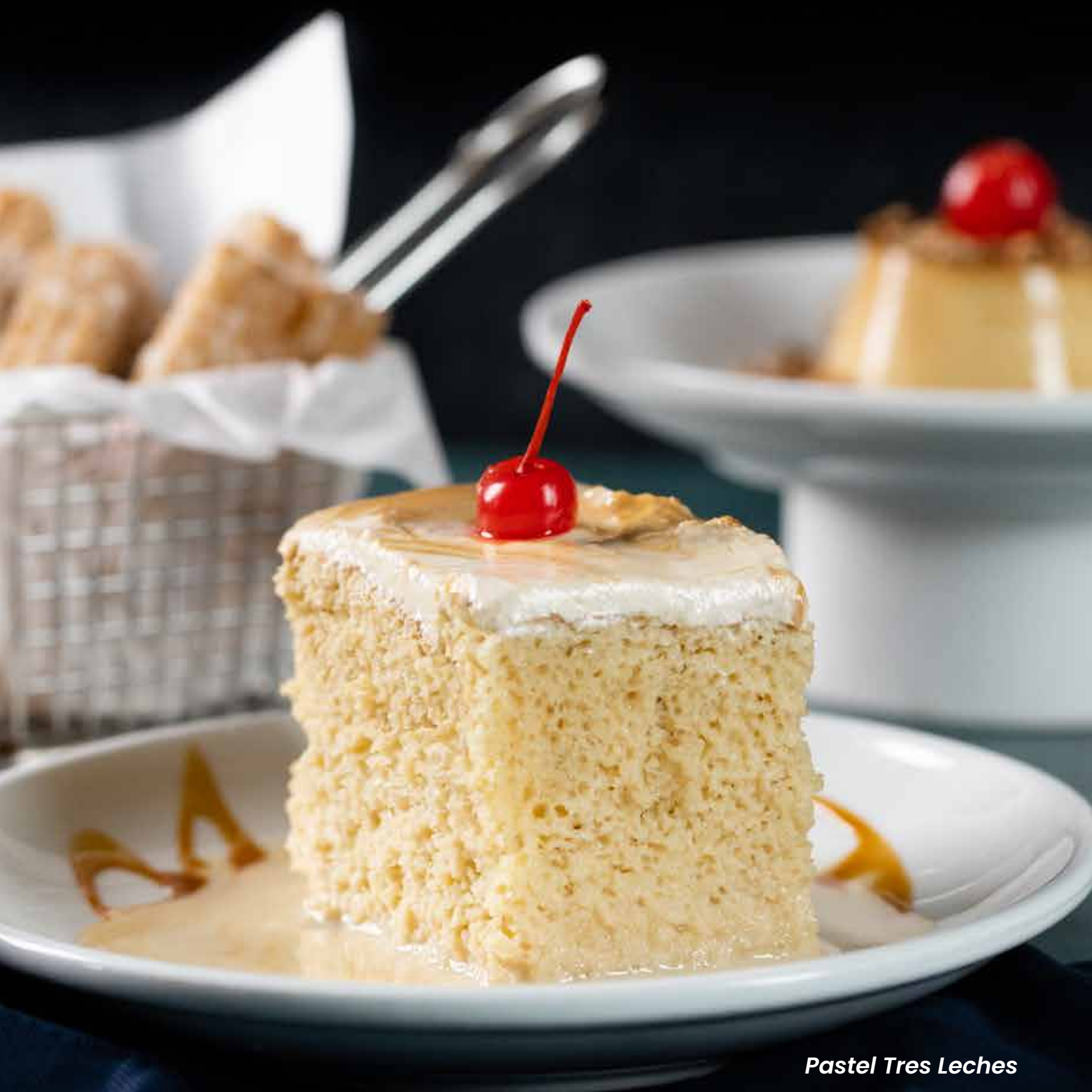
Pastel Tres Leches

Satisfy your sweet tooth! Sample size portions of flan, tres leches cake and churros. 17.50