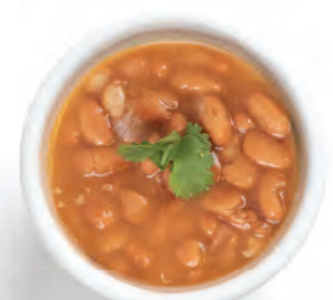
Frijoles Charros 3.50