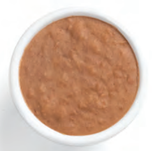
Frijoles Refritos 3.50