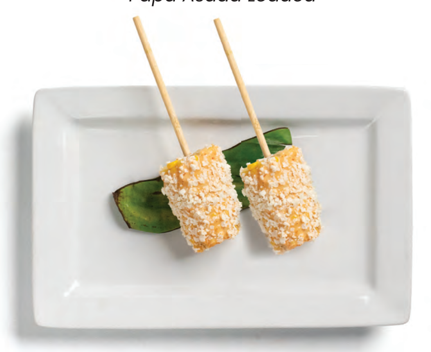
Grilled Corn on the Cup 8 Elote Asado Mexicano