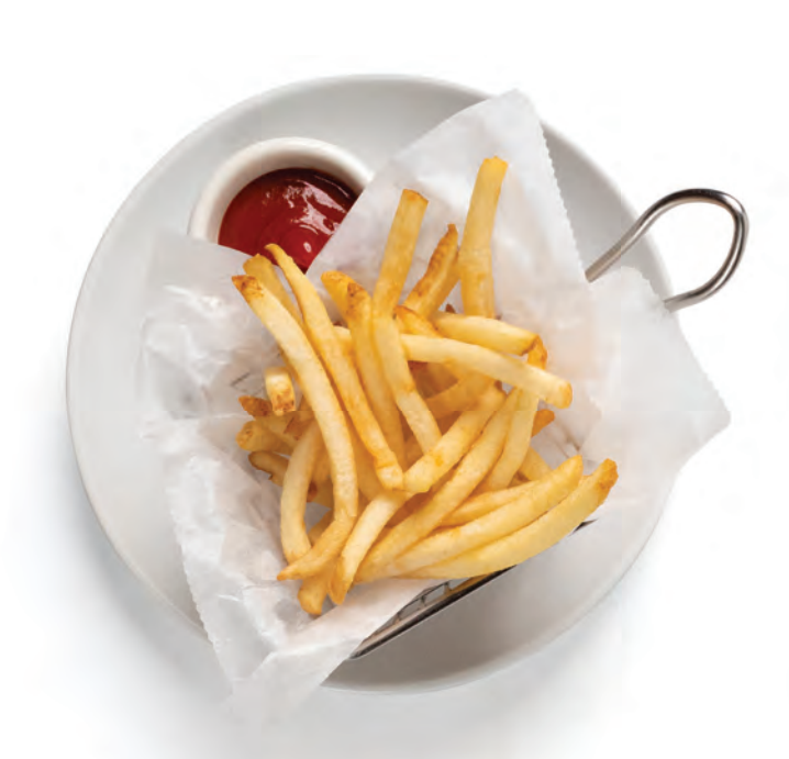
French Fries 4 Papas Fritas