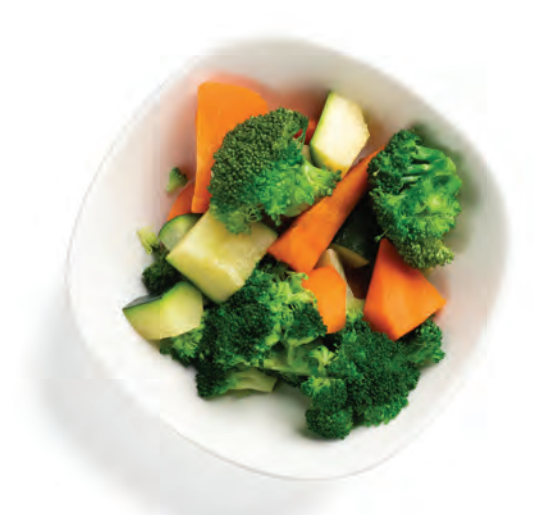
Buttery Steamed Vegetables 4 Vegetales al Vapor