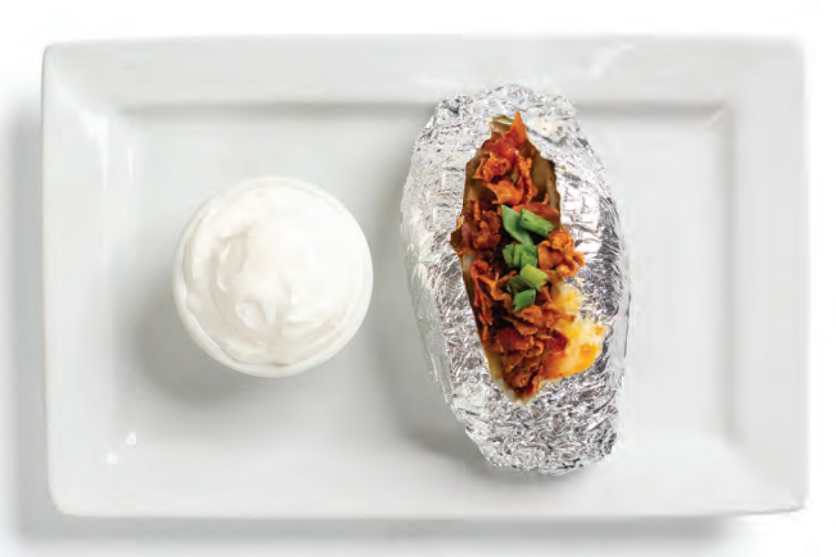
Loaded Baked Potato 6 Papa Asada Loaded