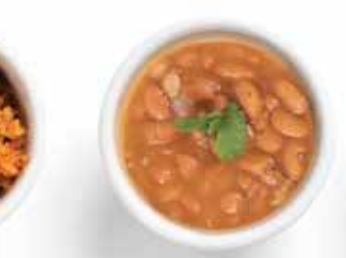
Frijoles Charros 5.50