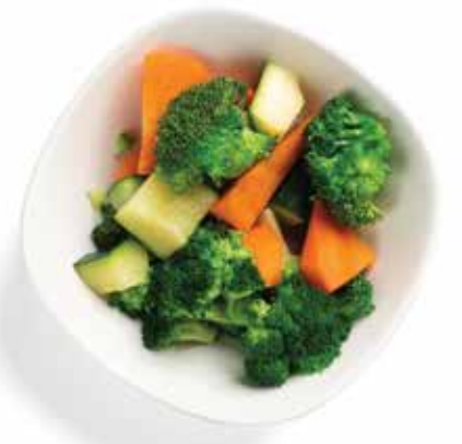
Vegetales al Vapor 5.50